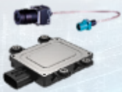
ADAS Camera & Radar